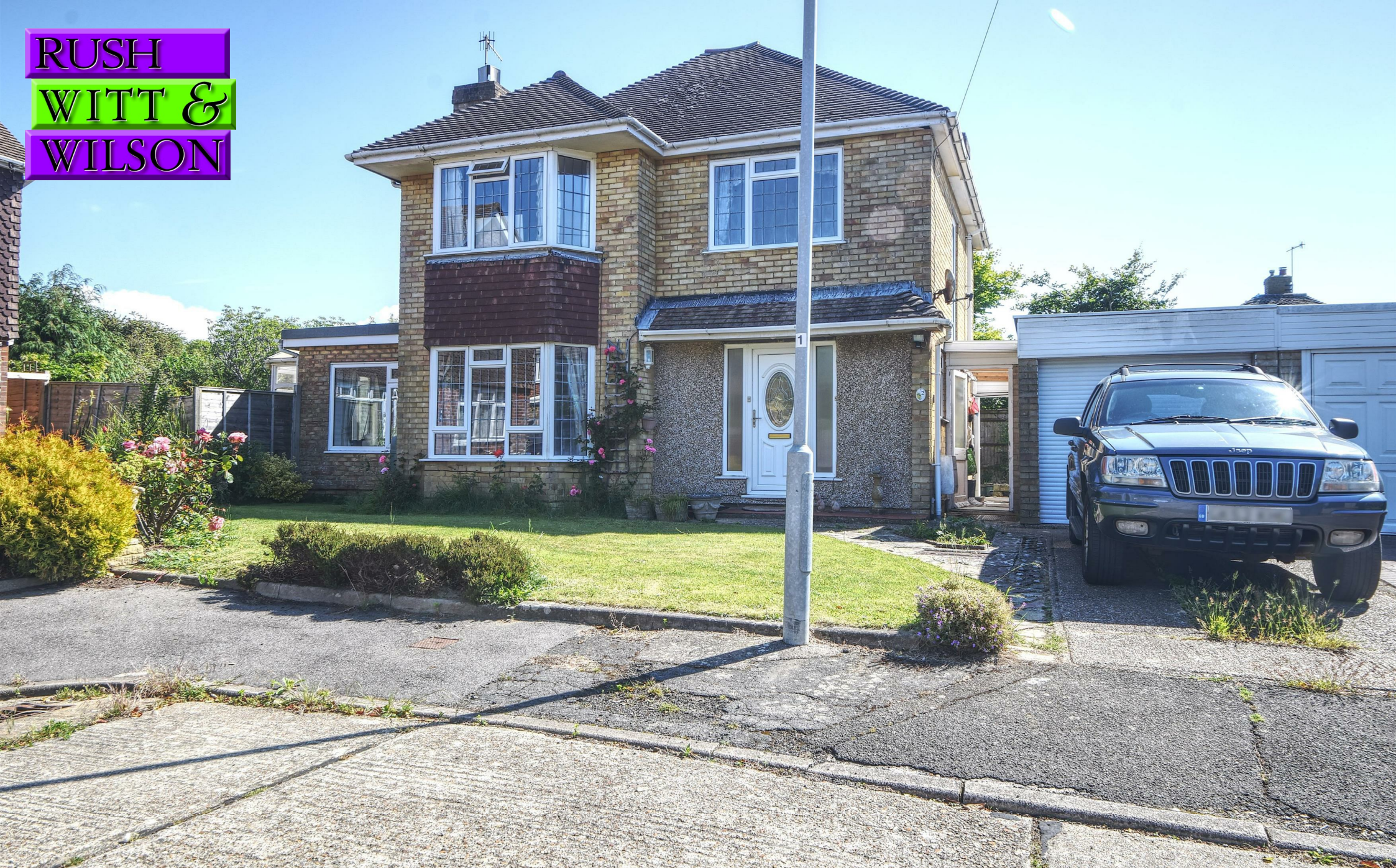
2 The Shrublands, Bexhill-On-Sea, East Sussex TN39 3SJ £485,000